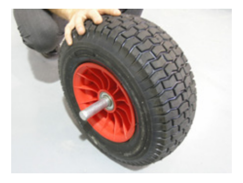
Step 18. Place shaft (11) through the wheel (10).