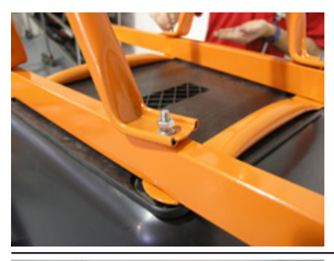
Step 7. Place stand (6) in place.