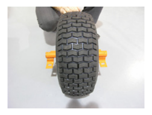
Step 20. Place wheel assemb

Place wheel assembly on top of the handles (5) and secure with S3 bolts.