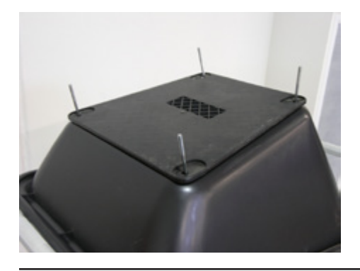
Step 4. Place Support Mat (3) of

Place Support Mat (3) on tub with the flat side away from the tub as shown.