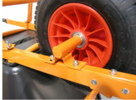
Step 21. Secure the bolt with washer, spring washer and the nut.

Place wheel assembly on top of the handles (5) and secure with S3 bolts.