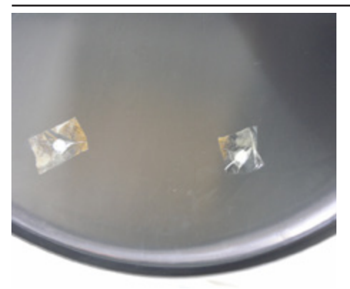
remaining holes located at the front of the tub.