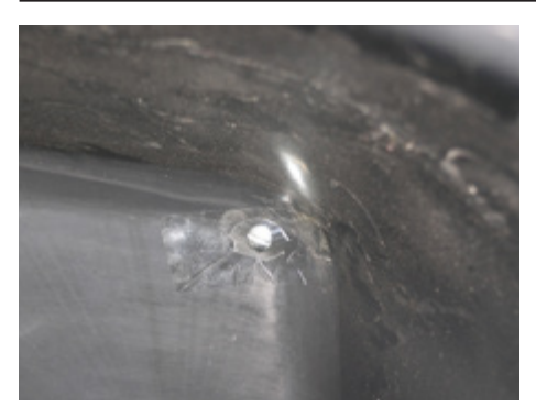
Step 2. Once inserted place a strip of sticky tape over each bolt in order to hold the bolt in place.