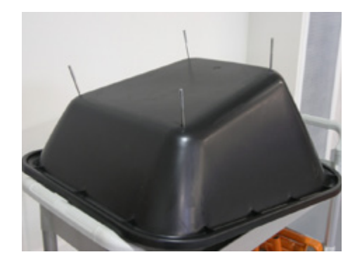
Step 3. Once sticky tape is placed over the bolt, rotate the tub upside down.