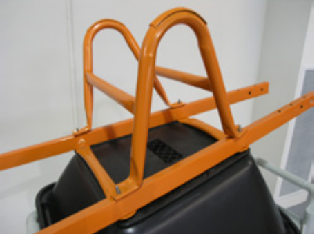
Step 8. Secure the bolt with washer, spring washer and the nut.