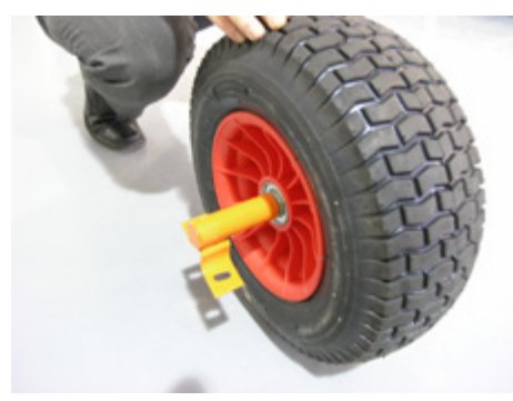
Step 19. Slide the wheel supports (12) on both sides of the shaft.